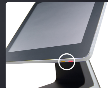
Improved power button & status LED design