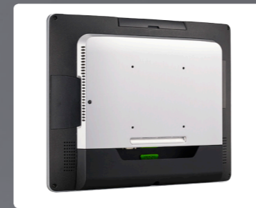
Standard VESA wall mount option