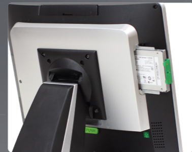
Equipped with 2.5" SATA drive slot and onboard M.2 SSD storage (option)