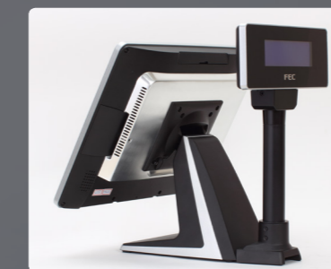
Integrated Pole Type Customer Display