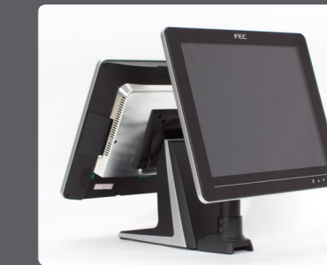
Integrated Pole Type 15inch Display