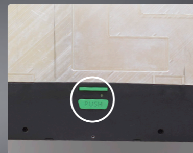
One touch access to remove the main unit.