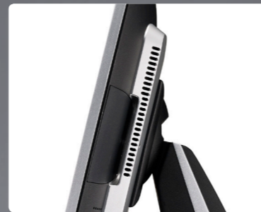
Smart Fan detects CPU temperature and adjusts fan speed automatically