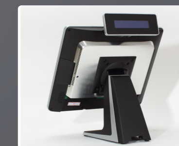
Integrated Customer Display