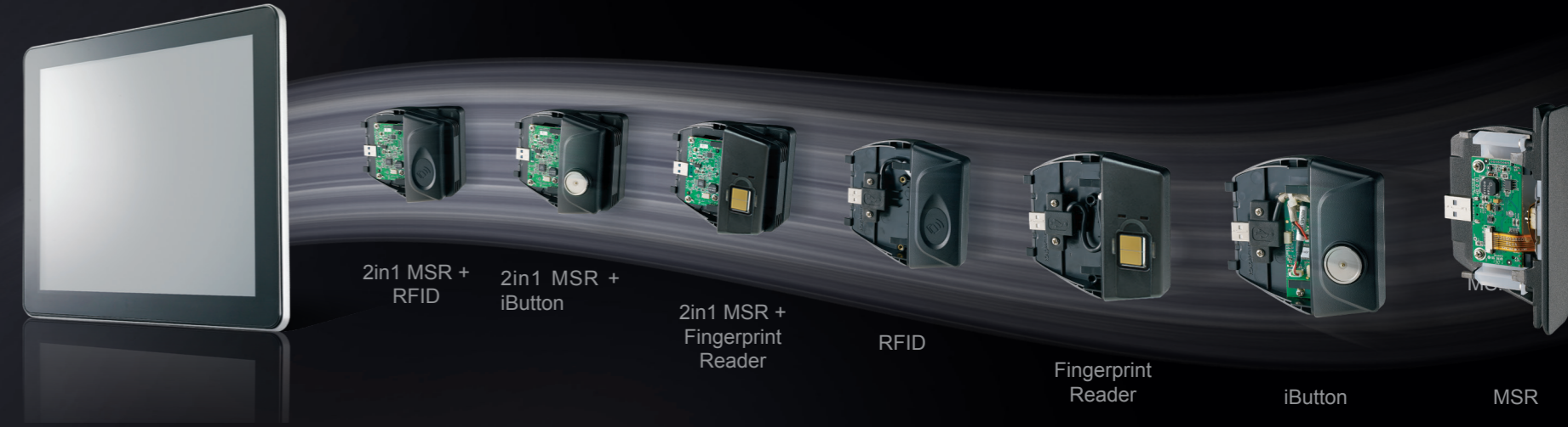
2in1 MSR + RFID

USB I/O on the right side (standard) of the display